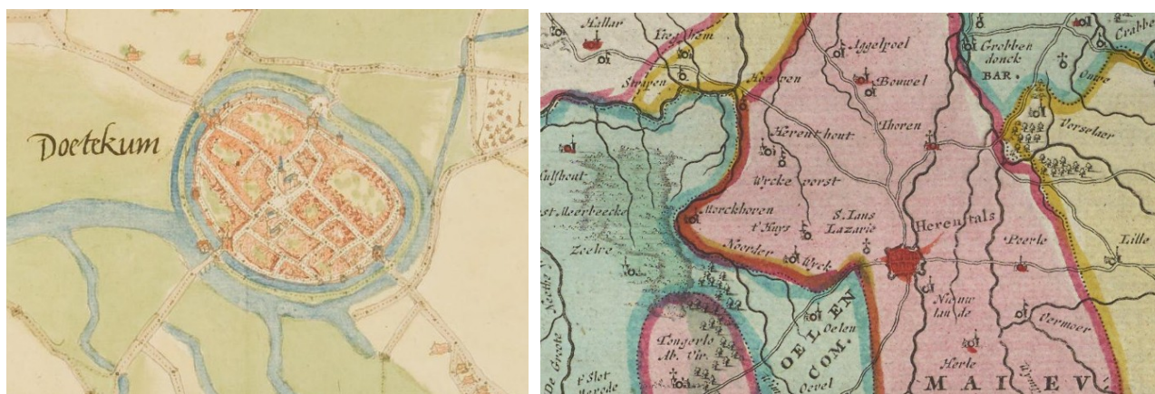
Map of Doetinchem by Jacob van Deventer (16th century) and the region around Herentals on the map Tertia Pars Brabantiae by Joan Blaeu (1665).

Archaeology may provide additional evidence for mapping premodern roads. 29 Traces in the landscape such as holloways, boardwalks, remains of pavement or remains of bridges are known frequently from many regions. However, their interpretation comes with a number of problems. For example, since they often concern fragments or short stretches, it is hard to connect remains of a road to a certain route or to decide whether it was a locally used road or one of (supra-)regional importance. Holloways are most pronounced on steep slopes, where there is the most erosion, which usually only concerns a small part of the route. In many areas, remains have been built over or disturbed. Moreover, in the absence of additional finds on or next to the road, it is often impossible to date the remains to a certain period. Helpful tools are further provided by modern techniques such as laser scans of the elevation (LiDAR), which can reveal creases in the terrain, or satellite imagery, which can reveal structures in the soil based on colour differences in the vegetation, especially in dry periods, both possibly pointing at former roads.