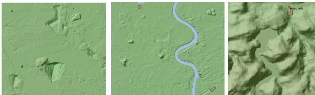
Lignite surface mines between Aachen and Cologne; Spoil tips from waste material from mining activity and traces of modern harbour structures in the Ruhr area near Duisburg; Dammed valley reservoir in the Sauerland region near Meschede.

The elevation on the palaeographical background map is generated from the digital elevation model (DEM) of the European Copernicus satellite programme, 68 with the underlying assumption that in hilly and mountainous areas, where the elevation has the highest influence on the course of pre-modern roads, the elevation has undergone no significant natural changes during the last centuries. Nevertheless, modern activity has left its traces in the elevation of the landscape as well. Most of these modern disturbances are relatively small and visible mostly on high resolution DEMs, such as embankments of canals and highways. The 25m resolution used by the Copernicus DEM blends out most of those while maintaining a good level of detail. However, some artefacts of modern activity remain, such as large-scale mining activities and reservoirs in dammed valleys (see examples below). As these large-scale disturbances remain limited to a few instances and only cross pre-modern routes on a small number of occasions, we have not tried to eliminate them from the elevation model. Similarly, dunes in the coastal lowland areas have naturally wandered through the centuries, causing misalignments of the dunes and the historical coastline (see below) in some areas, such as the Wadden islands, but these areas only play a marginal role in the long-distance road system.